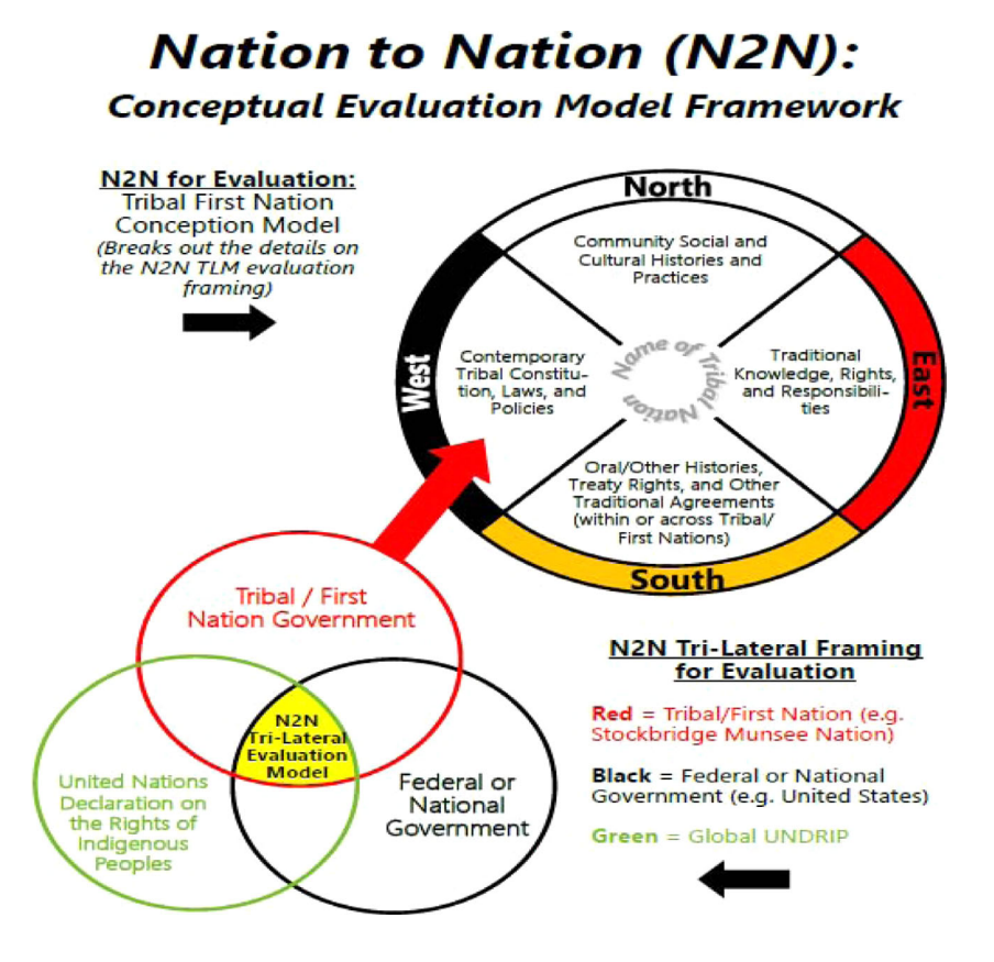
Figure 8.1. Nation-to-Nation (N2N) conceptual evaluation model framework.

ical evidence developed between Indigenous and non-Indigenous governments and communities of evaluators. UNDRIP is a legally vetted, legitimate Nation-to-Nation framework. It could be employed through the UNEG, and related evaluation parliamentarian partners, to inform the SDG Evaluation 2030 agenda. Through the EvalPartners, UNEG, and International Organization for the Cooperation in Evaluation (IOCE) sponsored Global Evaluation Forums, there have been many testimonial videos by Indigenous people (EvalPartners, n.d.). As noted earlier, many Indigenous scholars have published in evaluation, provided recorded testimony in UNDRIP events, and participated in UN-sponsored EvalPartners global initiatives via EvalIndignous. So why do knowledge, access, and participation gaps continue?