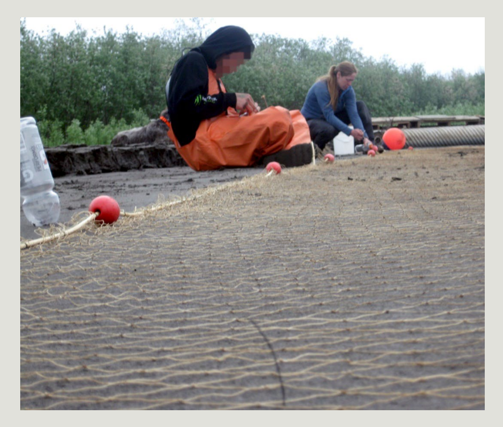
BYF youth learning to mend a net at fish camp.