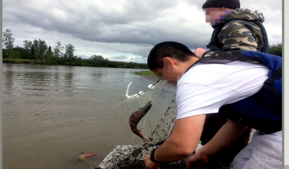
Bethel Youth Facility Residents Learn to Catch, Clean, and Dry Fish at Culture Camp